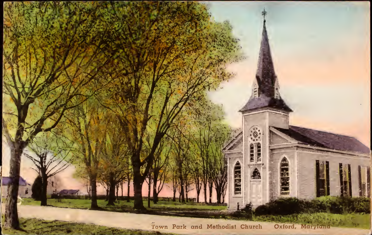
Town Park and Methodist Church Oxford, Maryland